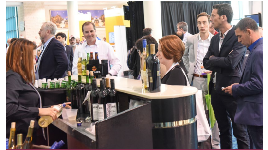
Contact Show Management

Give attendees a chance to network, conduct business and learn about your products/services in a fully customizable hospitality area. Generate brand awareness in a dedicated area with a captive audience by providing a specialized experience to showcase your brand's personality. Does your brand promote health and wellness? Create a juice bar! The options are endless.