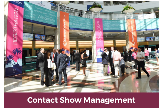
Contact Show Management

Maintain your brand's visibility through each step of every visitor registration for Seatrade Cruise Global 2019. Starting at the registration portal on the Seatrade Cruise Global website, and through to the on-site registration and badge pick-up, each and every visitor will consistently interact with your company's image.